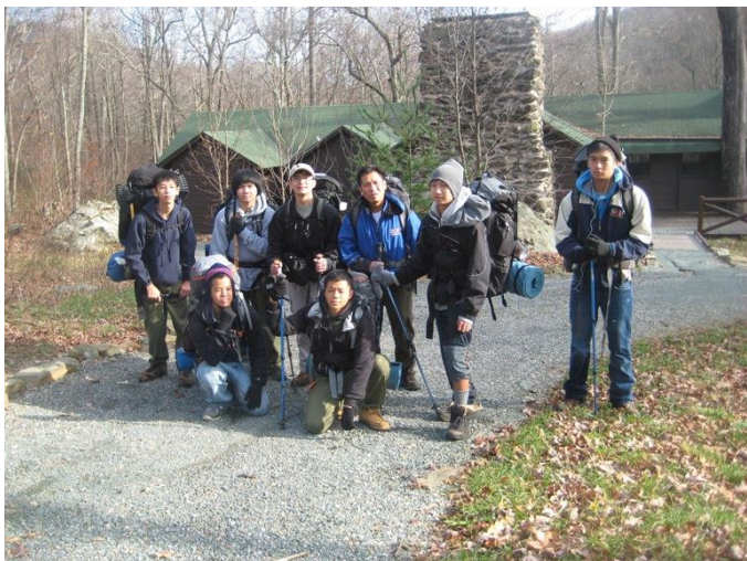
In front of the cabin that belonged to President Hoover

So far our troop has only done car camping. In order to experience the most challenging camping, one must do backpacking. Backpacking involves hiking to a camping location while carrying a pack which contains food and gear for the hikers. Troop will have a backpacking trip on March 16-17. For our troop, backpacking is a requirement for rank advancement for First Class and higher. Below are some photos of the Troop backpacking in the past.