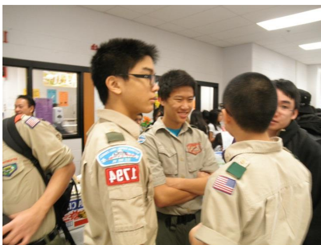
Can you tell what is wrong with this photo?