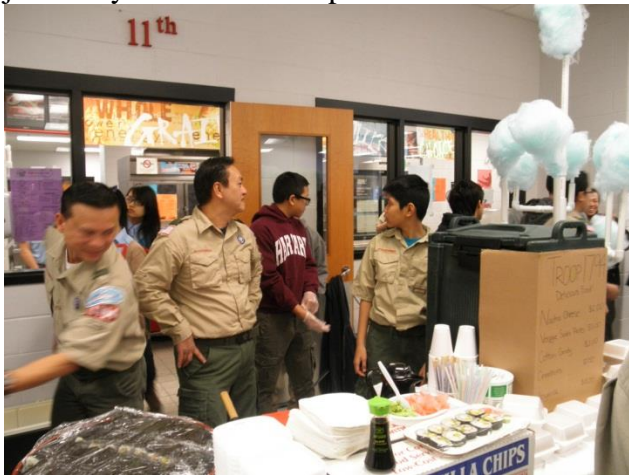
Where are the customers???