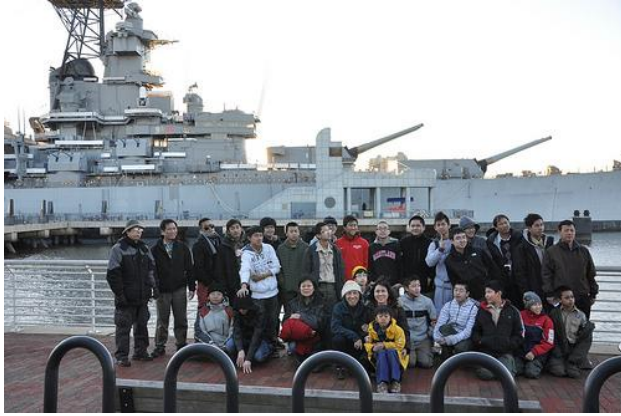
Ready for boarding

Around 4:30 PM we crossed the Delaware River into Camden Yard, New Jersey, where the Battleship New Jersey is docked. We rode the 6 minute 4D Flight Simulator of the Seahawk: Battle for Iwo Jima, prior going on board. The New Jersey is the most decorated battleship in US history. It participated in World War II, the Korean War and Vietnam War.