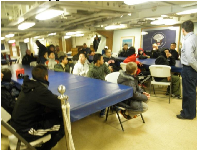
This room was used as a courtroom or as an operating room.

Around 5:30 PM we went on board and were assigned of the bunk beds. The ship was fully booked by other boy scouts troops because it was the long holiday weekend of Martin Luther King and Inauguration Days. Around 8:00 PM, they asked everyone to be on the ship deck for the flag ceremony. It was windy and cold on the deck. Fortunately, the ceremony was short. Then, we went straight to the dining area. It is because we were the largest group and they assigned us to dine in the office dining room. The menu consisted of chicken tenders, broccoli, macaroni and cheese, lemon juice, and chocolate chip cookies. There was not enough food for some scouts so they got seconds.