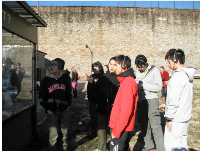
Scouts were taking a break in the prison yard

Al Capone's cell. He even had a moonroof.