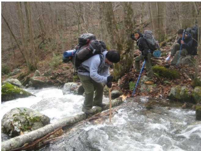
Crossing a stream