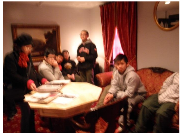
Eerie...did you see an invisible shadow in the mirror?