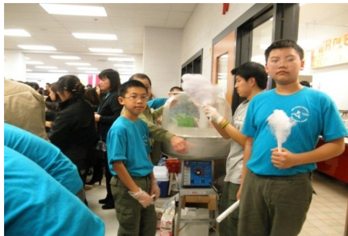
NO! I did not eat the candy. Yes! We made small candy for babies...