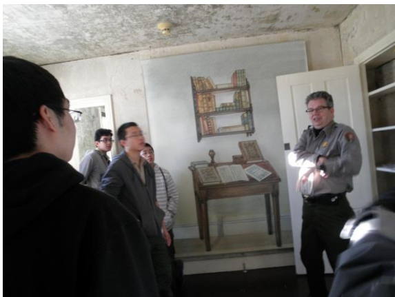
Ranger: I saw the ghost of Alan Poe, right here, right at this spot!!

After spending more than one hour at the prison, we drove to the home of author Edgar Allan Poe which is about 5 minutes from the prison. Edgar Allan Poe is a famous American writer who lived in this house for six years. After watching a short film about Poe life, a Park Ranger led us to tour the house and the garden.