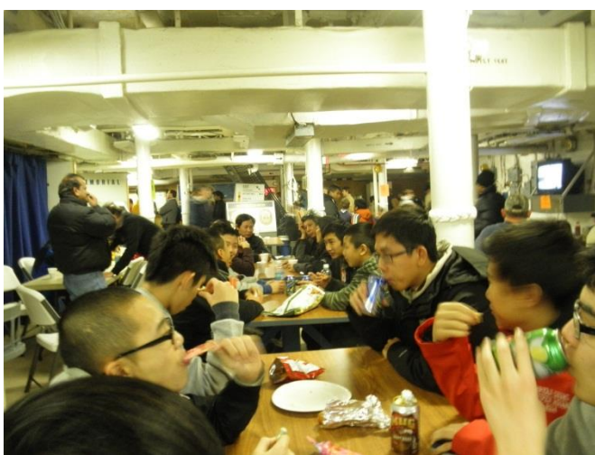
After the tour, everyone was hungry and tired...