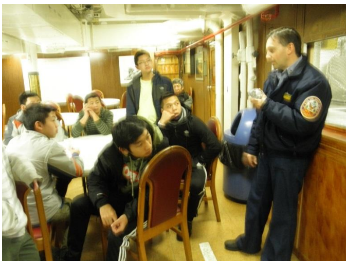
Feel like a sailor?