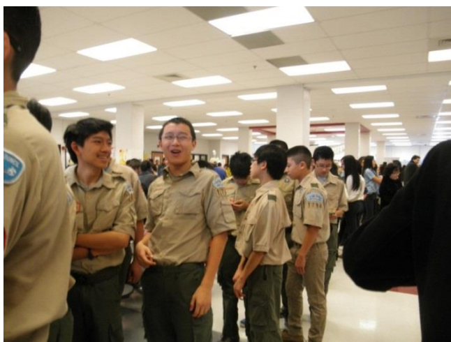
Scouts are lined up for the flag raising ceremony