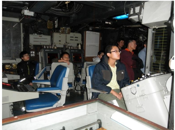
In the control and navigation room. Oh No! he hit a wrong button!

About 8:30 PM, they divided us into two groups. Each group had one tour guide. The tour lasted for nearly two hours. We saw the admiral's room, the navigation room, the strategy room, Tomahawk missiles, the crew's gallery, etc. The tour ended at about 10:30 PM. and everyone went back to the lounge to buy snacks, watch TV, and talk. All our scouts went to bed before midnight.