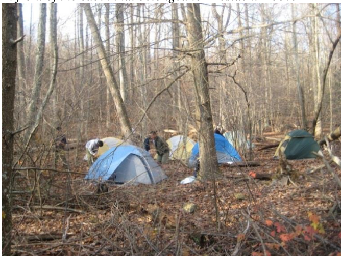
Set up your own tent