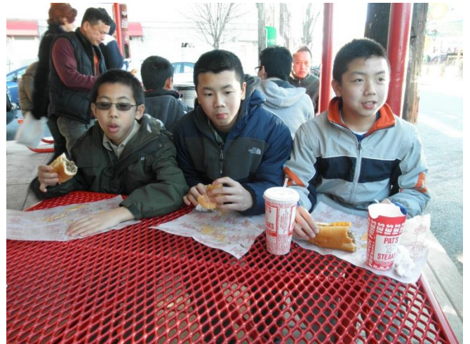
Mom's homemade steaks are much better...

After spending 90 minutes at the museum, we divided into two groups by choice of lunch. One would go eat Pho ga Thanh Thanh, a famous Vietnamese noodle soup. On the other hand, others preferred to eat the Philly famous steak and cheese.