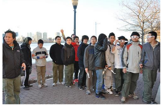
Lined up for the 4D Flight Simulator ride.

Around 5:30 PM we went on board and were assigned of the bunk beds. The ship was fully booked by other boy scouts troops because it was the long holiday weekend of Martin Luther King and Inauguration Days. Around 8:00 PM, they asked everyone to be on the ship deck for the flag ceremony. It was windy and cold on the deck. Fortunately, the ceremony was short. Then, we went straight to the dining area. It is because we were the largest group and they assigned us to dine in the office dining room. The menu consisted of chicken tenders, broccoli, macaroni and cheese, lemon juice, and chocolate chip cookies. There was not enough food for some scouts so they got seconds.