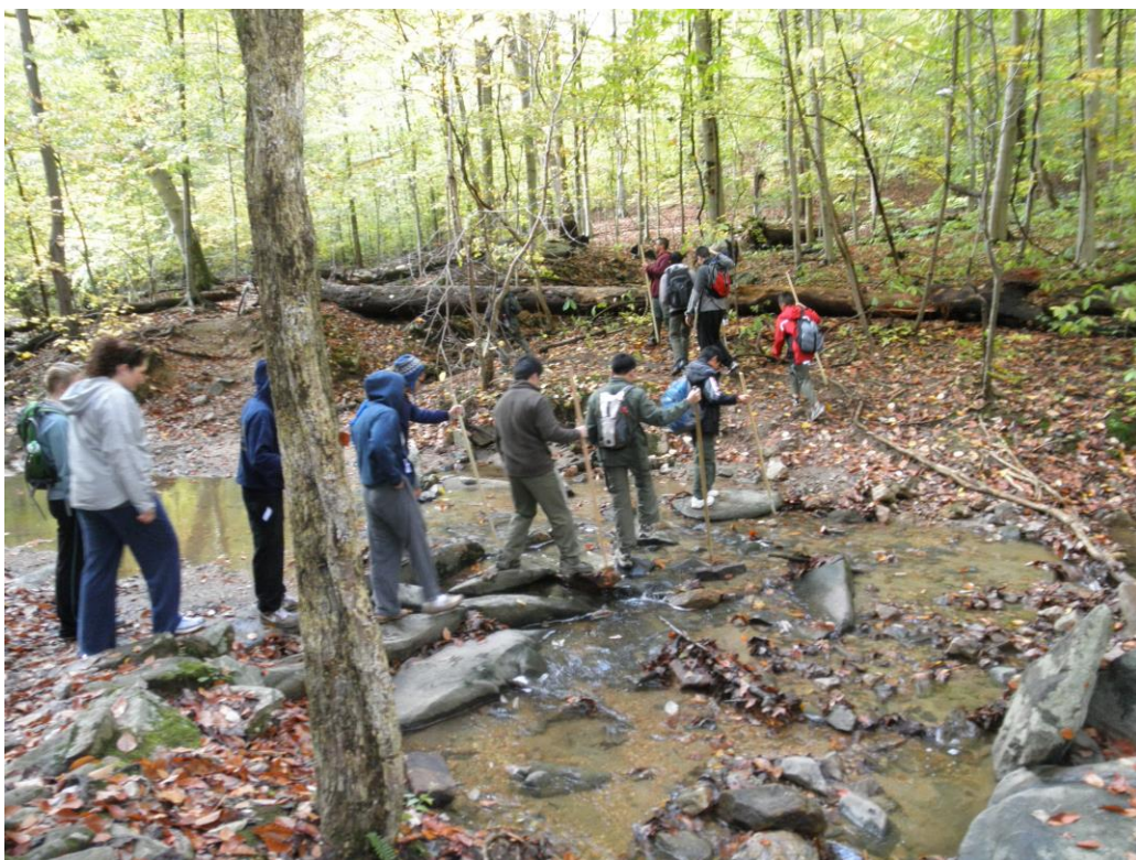
Tip toeing through a creek....Ascending back to camp