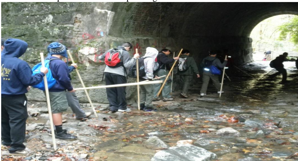
Walking through the tunnel. Someone is playing with his stick again...

This year Lien Doan Spring Camp out will be at the Patapso State Park where our Troop camped in fall 2012. Here are some photos of the Troop hiking in the Park last fall.