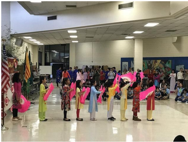
Juniors perform skit Tết Đền Rời