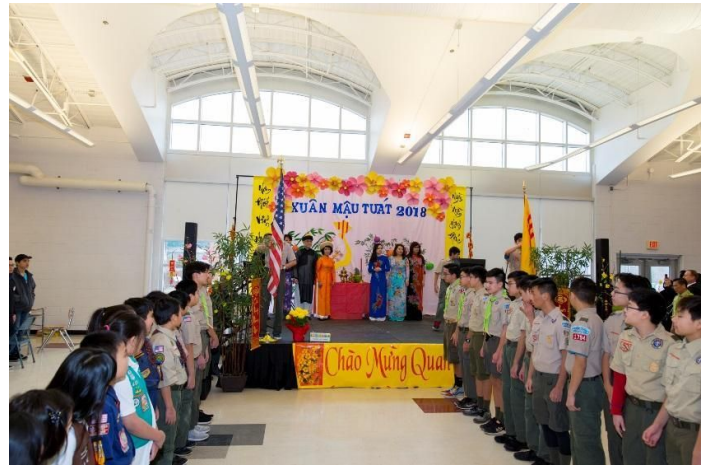
Scouts at flag ceremony