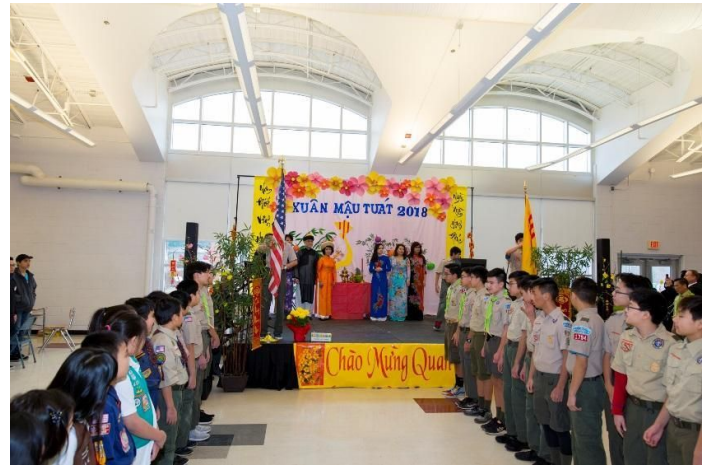
Scouts at flag ceremony