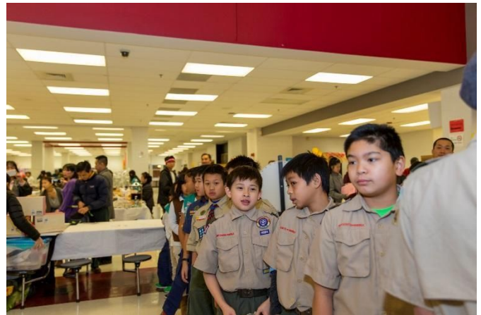
Getting ready for the flag ceremony