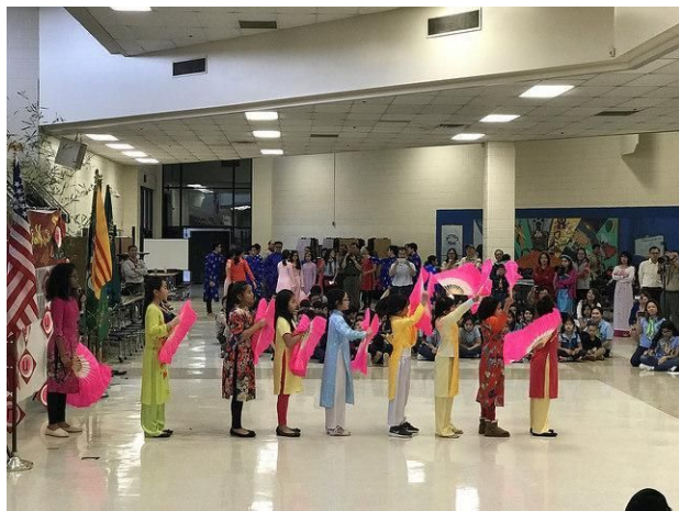
Juniors perform skit Tết Đến Rồi