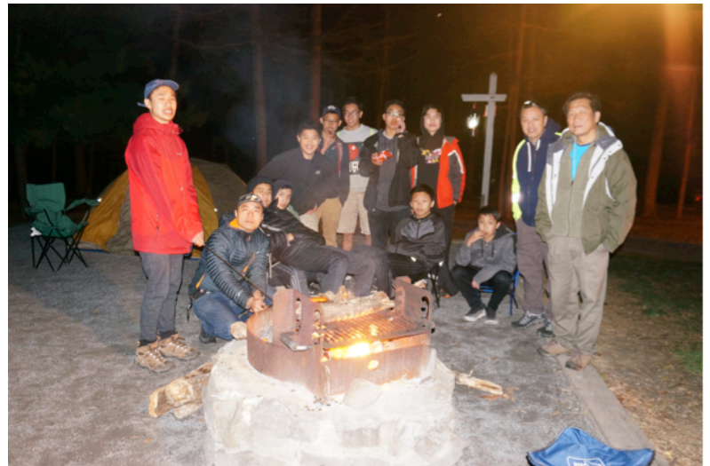
Friday Night: Camp staff relaxing and enjoying the campfire after a long night setting camp