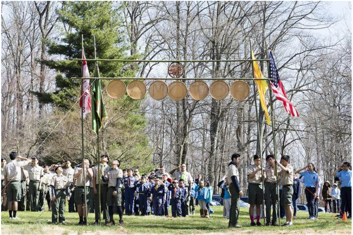
Color Guards raising the flags.