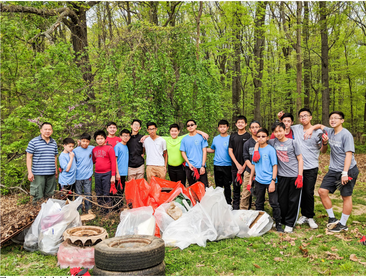
The scouts with their haul!