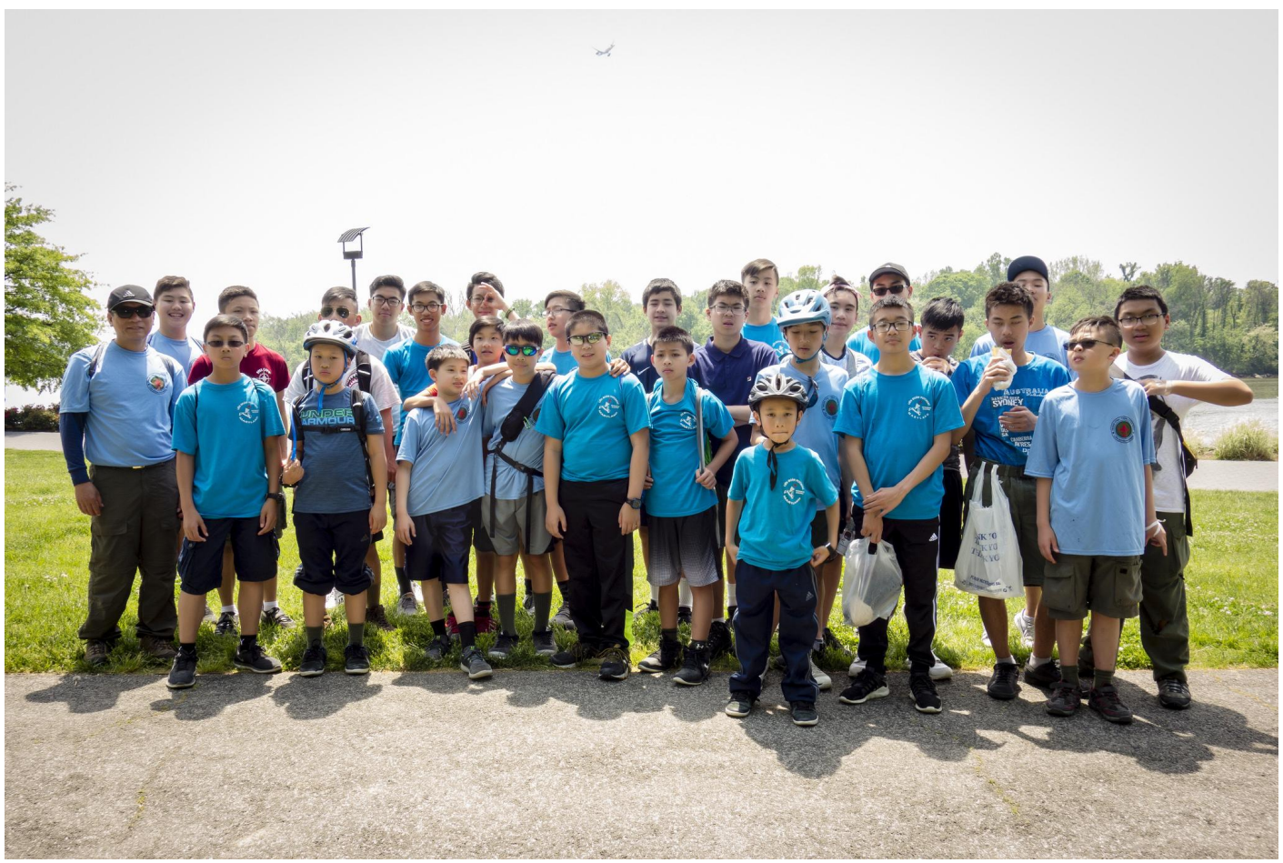
One last group photo at Georgetown!