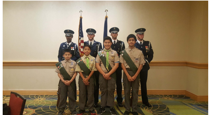
Posing with the USAF Honor Guards