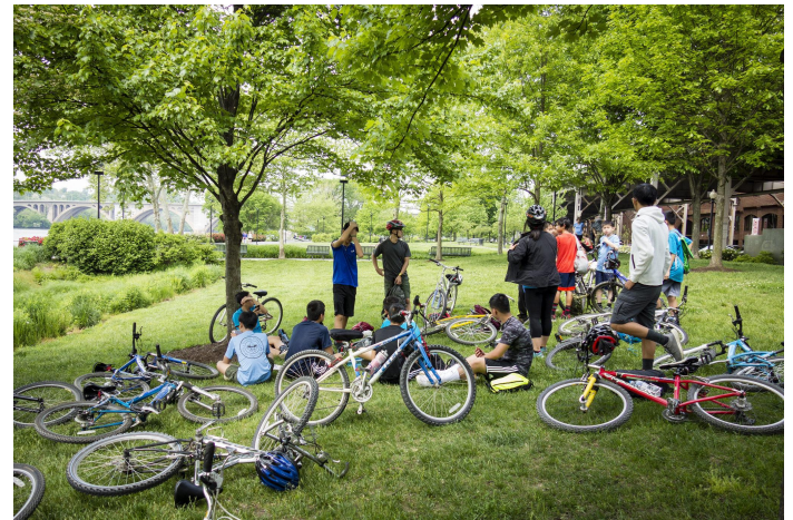
Scouts resting after finishing the first leg of their journey!