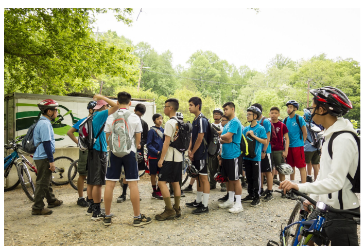
The scouts being briefed about their biking trip