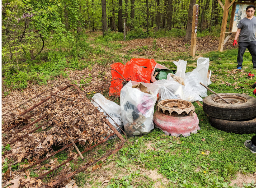
A fine assortment of trash