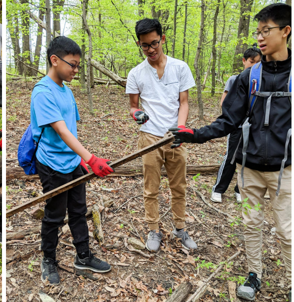
Picking up metal bar