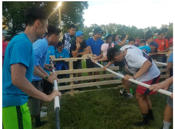
Playing human foosball