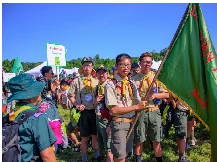
SPL Athen holding the Potomac flag