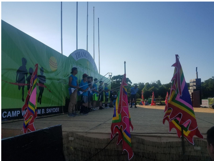
Practicing for opening ceremony

Chợ Đêm was a blast. Scouts began to spectate matches of foosball. They wanted to play too, so they assembled their own team and entered the tournament by paying a five dollar fee. The foosball frame was put together with the help of Potomac scouts earlier in the day.