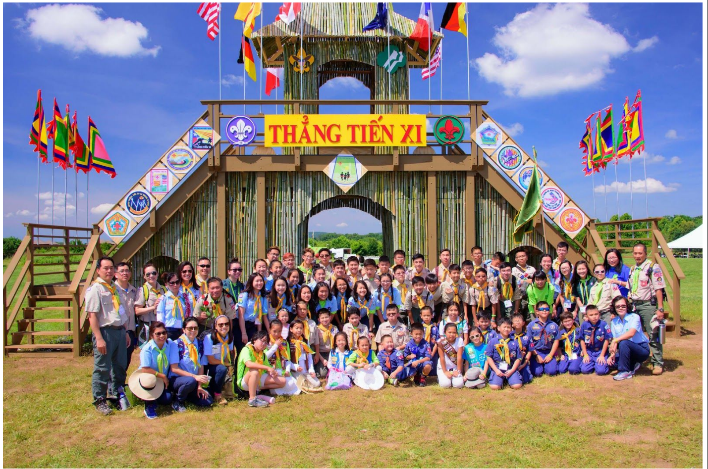
Liên Đoàn Potomac @ Thắng Tiến 11

All this fun and it's only the start of the 1st official day of Thắng Tiến 11. The rest of the week calls for culture day, lots of subcamps where we played games and do activities such as swimming, zip lines, and badge trading. We will also visit the STEM shed where we make ice cream using liquid nitrogen, create battery using pennies , and a dozen other workshops. It will be a good time.