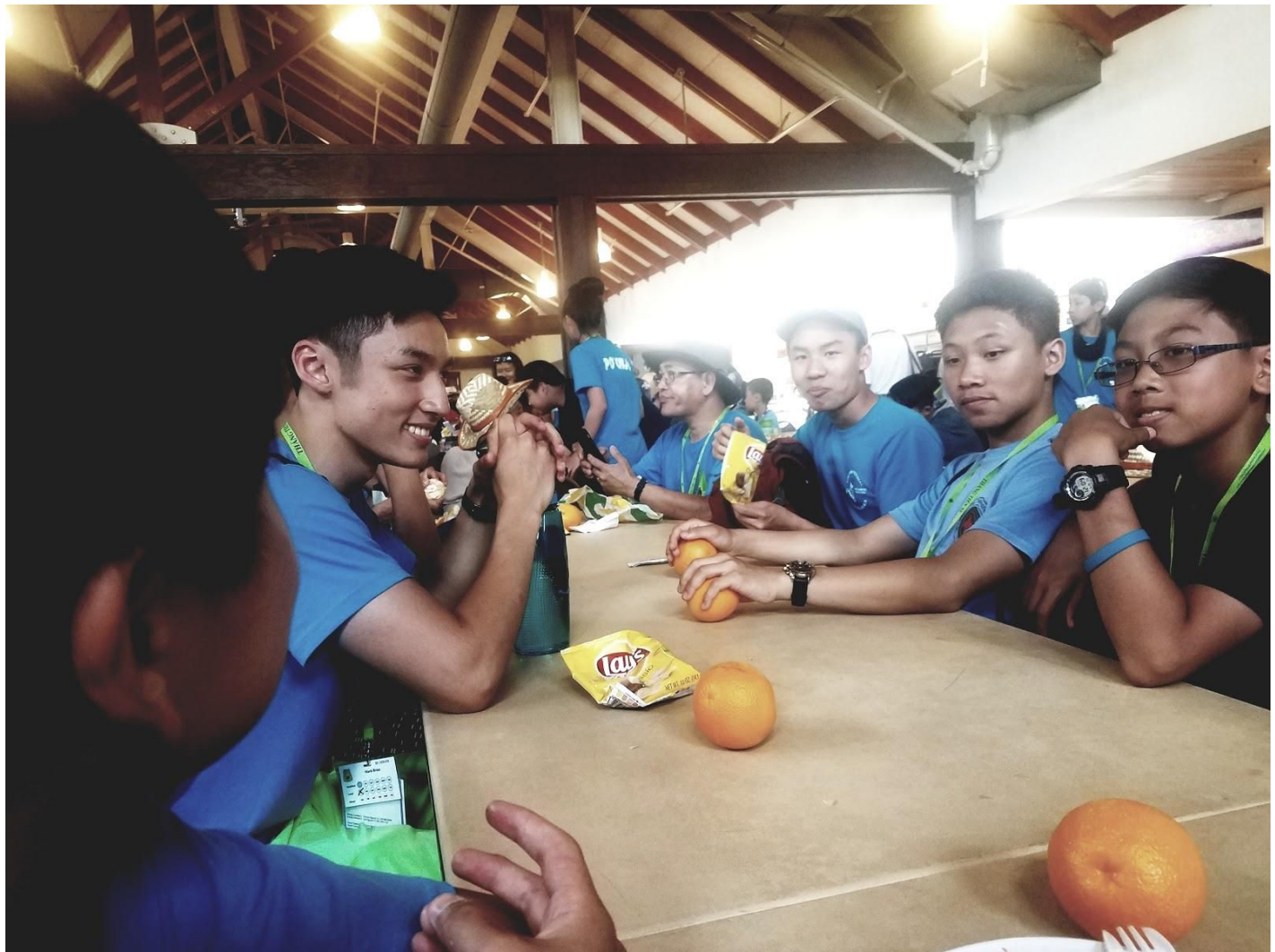
Scouts enjoyed their first meal of Subway sandwiches, chips, and fruits

After lunch, scouts returned to the campsite to discuss about activities for the rest of the week. They were able to socialize, play cards and volleyball. Everyone reminded each other to put on sunblock and drink plenty of water.