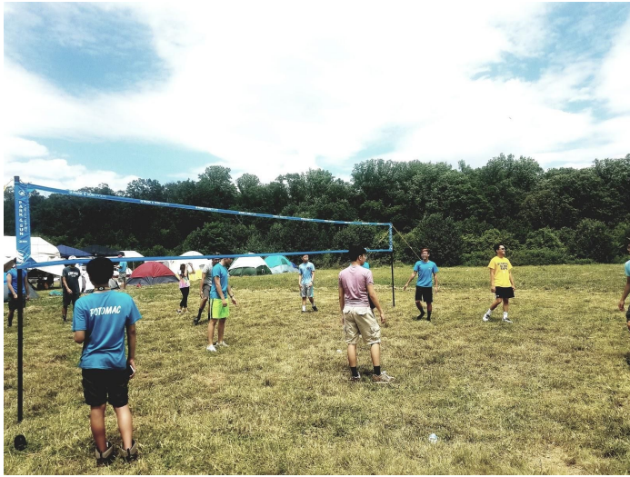
Potomac scouts play with scouts from other Lien Doans.