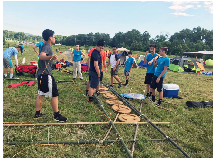
Scouts ready to raise the campgate