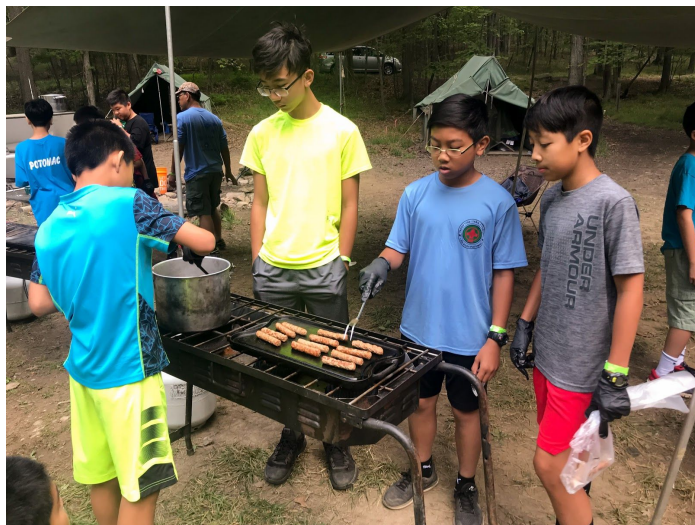
Everyone like cooking - Cleaning, not so much