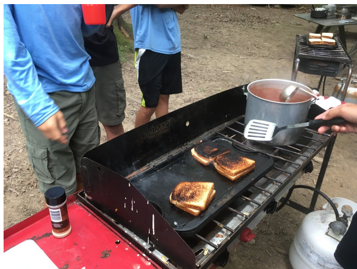
Scouts make grilled cheese with tomato soup for lunch

After the classes and our free choice activities, we returned to camp for dinner. Cooking dinner usually involved firing up the big stove. However, there were days that we cooked using dutch oven and tin foil cooking. The camp provided all of the cookware including tin foil, dutch oven, and charcoal.