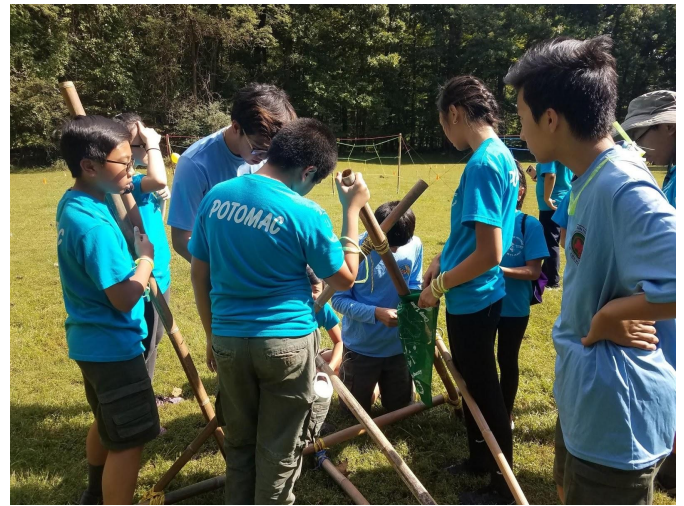
Scouts assemble catapults to launch water balloons