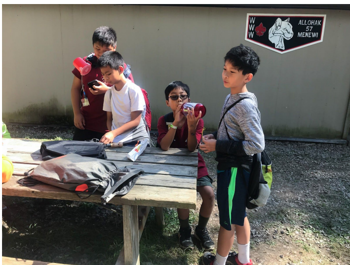
Scouts enjoying their time off at the trading post