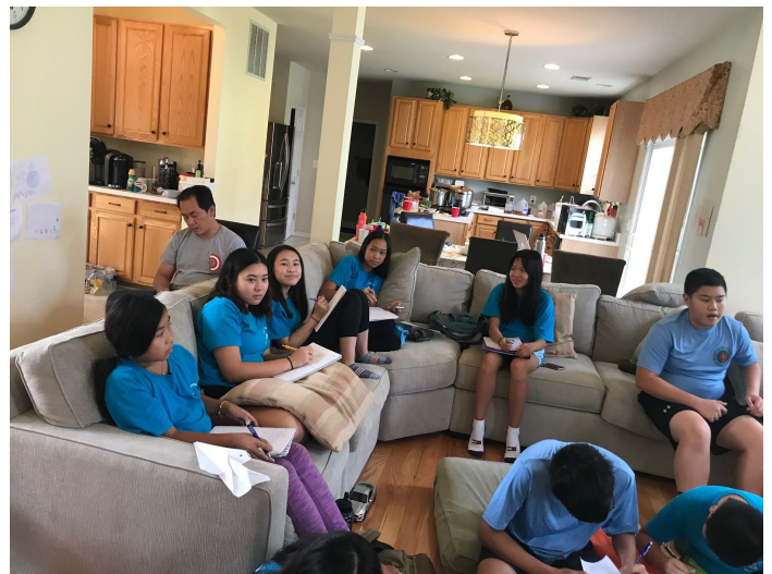
Scouts taking lots of note at class