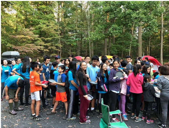
Hungry scouts with their mess kits