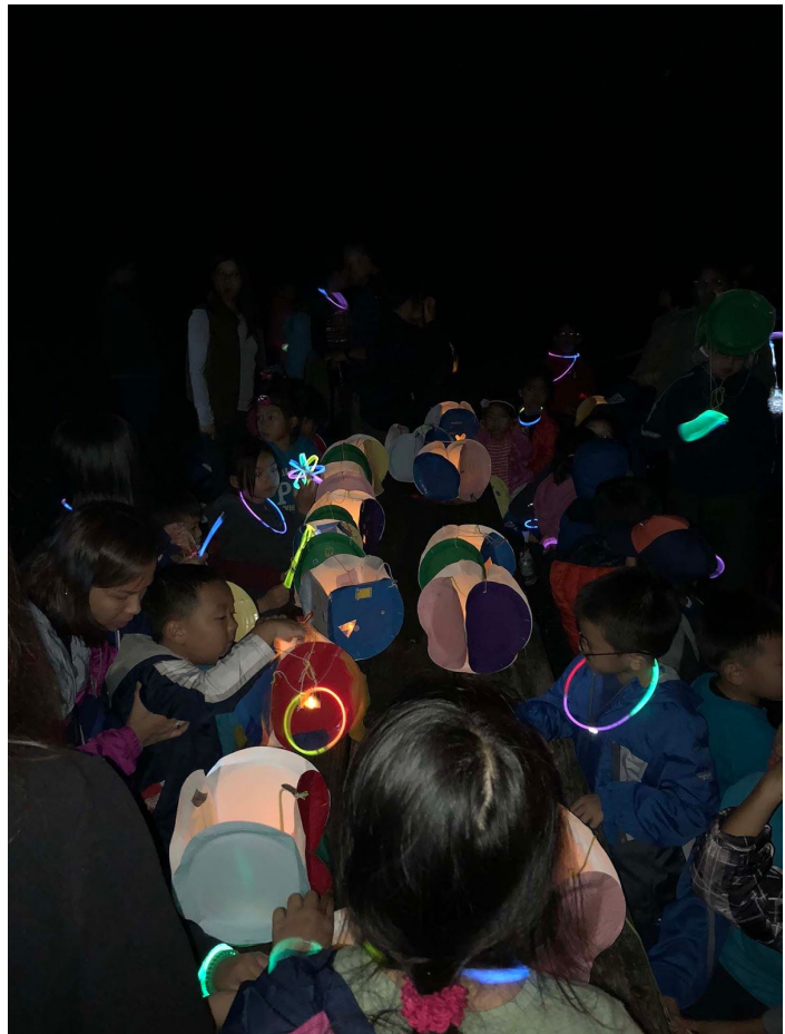
Scouts with their lanterns at camp fire

Dinner was an excitement as all patrols cooked something and shared with the rest of the scouts.