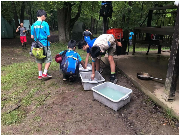
Clean up duty after meal