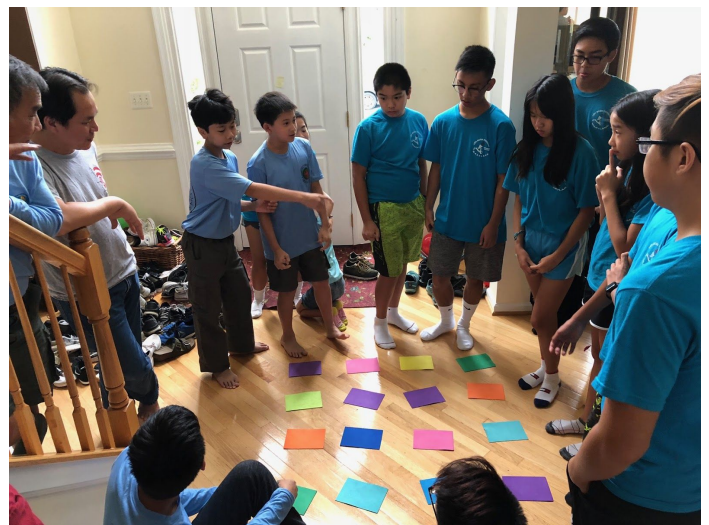
Scouts playing labyrinth, a team development game