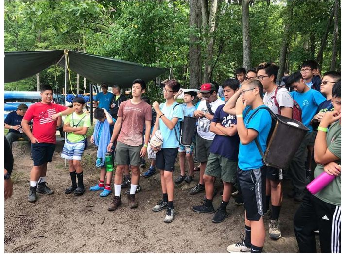
Scouts listening to the swimming instructor

After the first day, the next 5 days (Monday - Friday) is routine with meals, personal time, and merit badge classes. Each morning, we woke up around 6:30 am-7:00 am. One of our 4 patrols would attend the flag ceremony each morning by the lake. After the ceremony, each patrol had to send 2 scouts to the quartermaster's storage area to get the raw material for our breakfast. Breakfast usually consisted of eggs, toast, fruits, milk, and cereal. After we cooked, ate, and cleaned, we went to our merit badge classes.