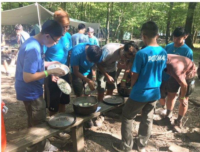
Scouts prepping the dutch oven for monkey bread