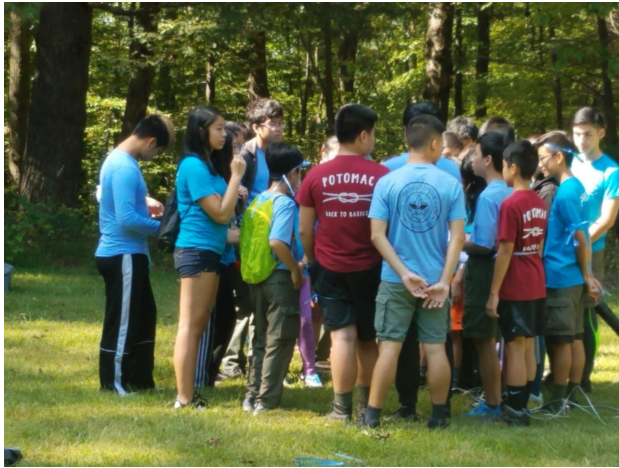
Scouts meet up with their patrols in preparation for the big games