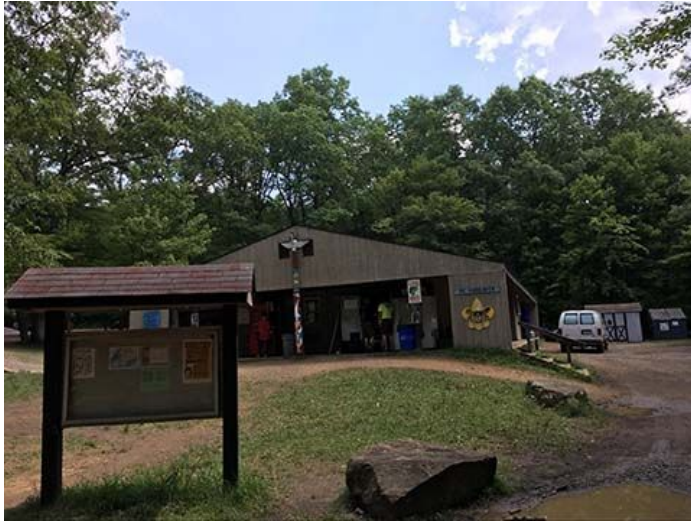
Picture of the Trade Post building, also behind it is the Quartermaster's storage