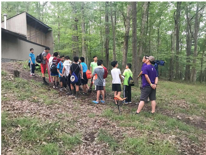
Scouts waiting to take a shower