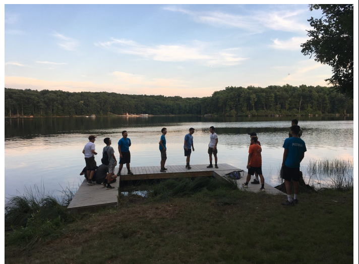
Everyone meet up at the dock to view the sun and get signal