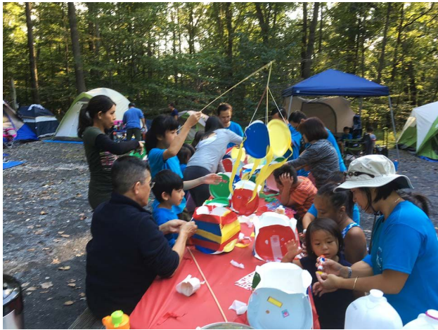
Parents helping cubs making lồng đèn

lanterns or lồng đèn out of paper plates. Displaying lồng đèn is a tradition in Vietnam during the mid-autumn festival, or Tết Trung Thu . The lanterns were very pretty at campfire.