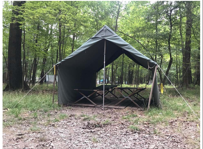
Our house for the entire week - A roof and 2 beds