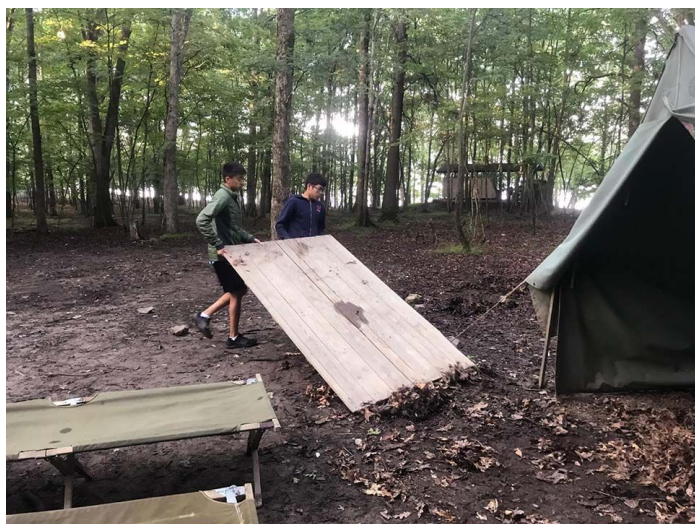
Francis and Brian dismantling our campsite

Finally at closing campfire, it started to rain just like it did at 2017 Goshen on the very last day but this time it wasn't so bad. Then the next day we all packed up, placed the floorboards of our canopies up on a tree and conducted police lines to pick up trash. Overall the camp was a fun and joyful experience for everyone. Everyone got something out of the camp.