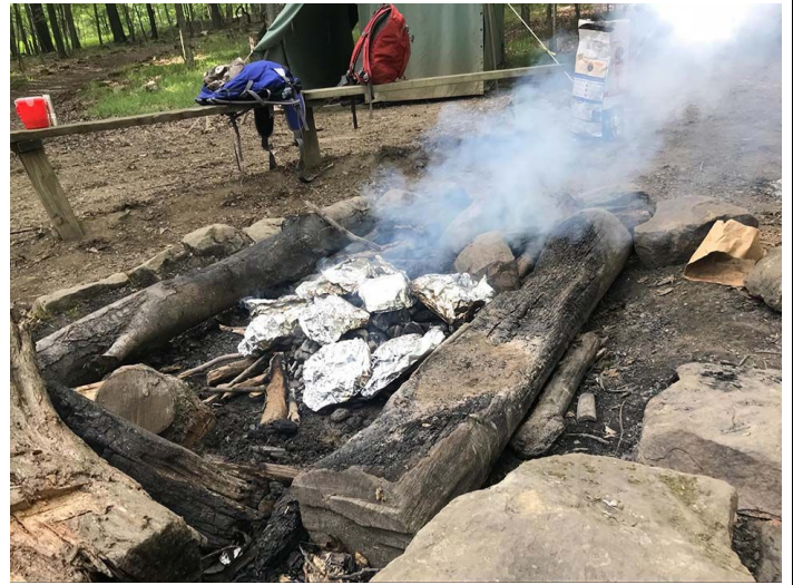
Scouts cooking chicken using tin foil in the campfire