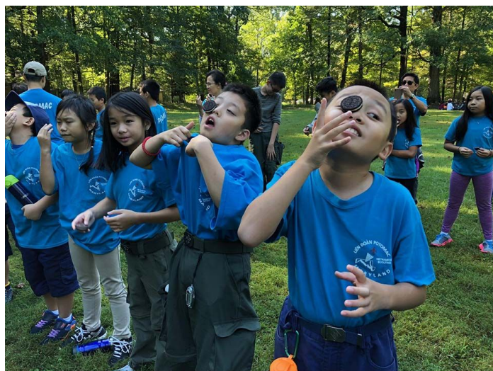
Oh - so fun and yummy

We started the game with an ice breaker. The challenge is to put an Oreo cookie on your eye and try to move the cookie into your mouth without using your hands. Surprisingly, it is harder than it looks.