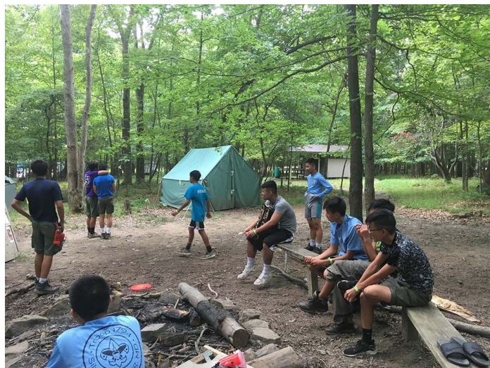
Scouts break and socialize during lunch

We returned to camp from classes around 11:30 am to prepare for lunch. Just like breakfast, each patrol had to send 2 scouts to the quartermaster's storage area to fetch the raw material for our lunch. Lunch usually consisted of sandwiches, chips, and some sort of drink. After lunch, all of the scouts would go to various location in Camp Liberty to attend the afternoon sessions of merit badge classes.