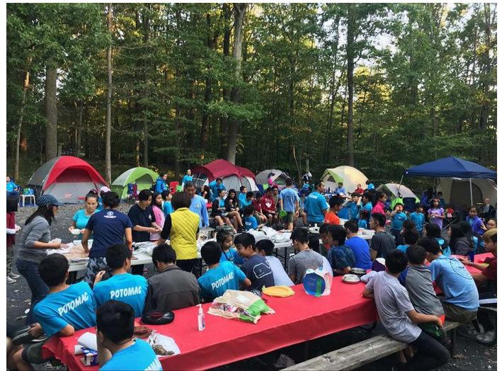
Eating area courtesy of Pack 1794 - Red table cloth at camp is luxury

Next morning saw knot and lashing challenges meant to be good practice for younger scouts, and for scouts who want to break records. Morning ended with an Interfaith and then closing.