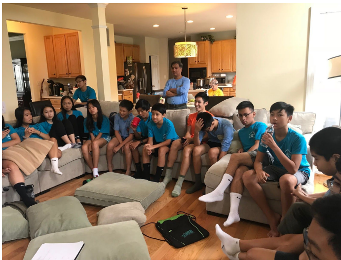
Scouts laughing at a joke at ILST