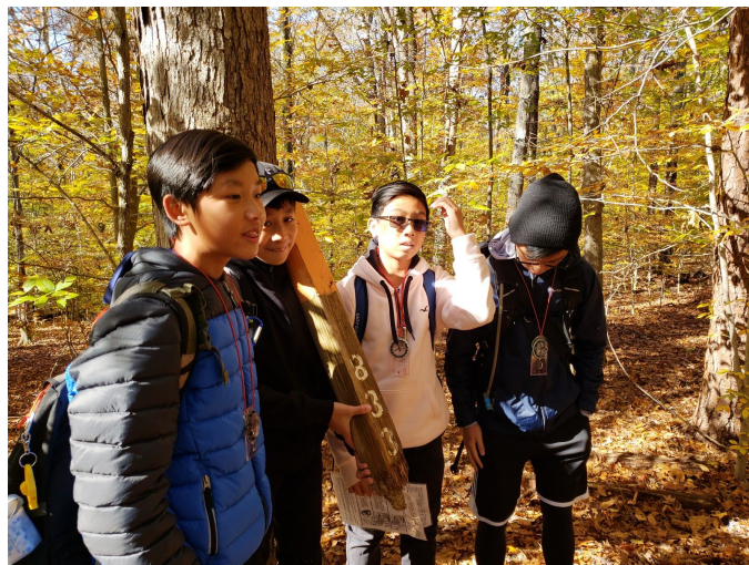
Damon's group finds their first marker