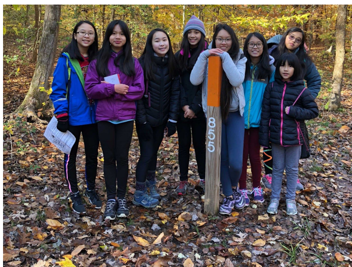
Girls smile after finding tough marker