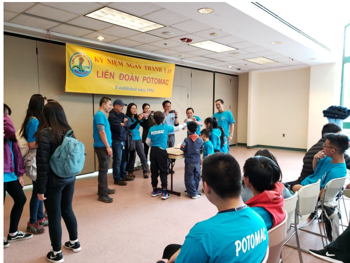
Happy Birthday Potomac !!!