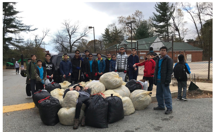
This trash is no treasure !!!