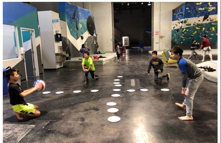
Scouts play 4-squares.