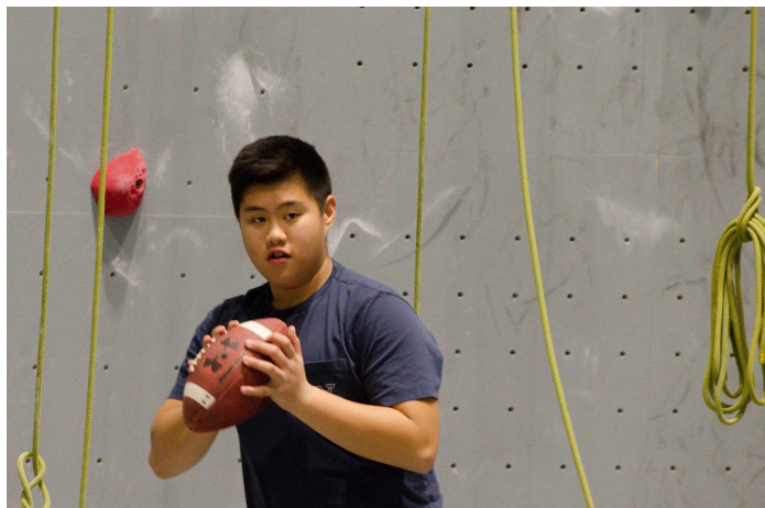
QB Vincent practices for the Super Bowl.