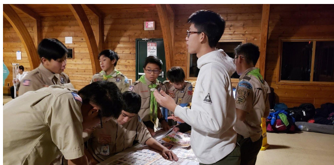
Scouts deciding what to buy with their budget