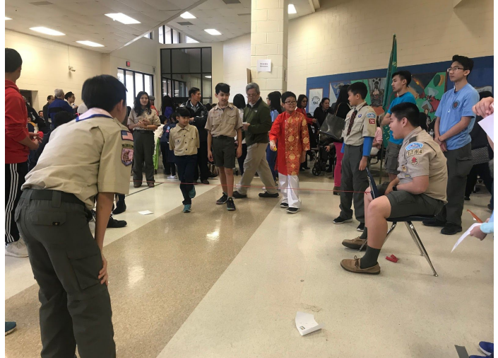
Troop oversees the Đá Cầu game