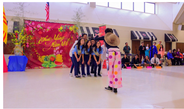
The girls doing their skit