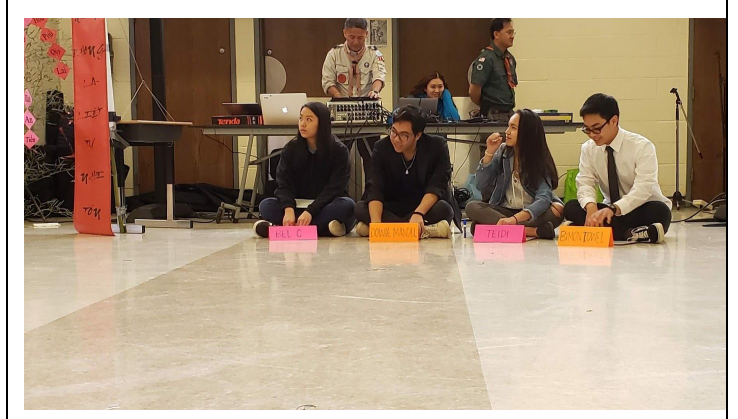
The "Judges" of the talent show