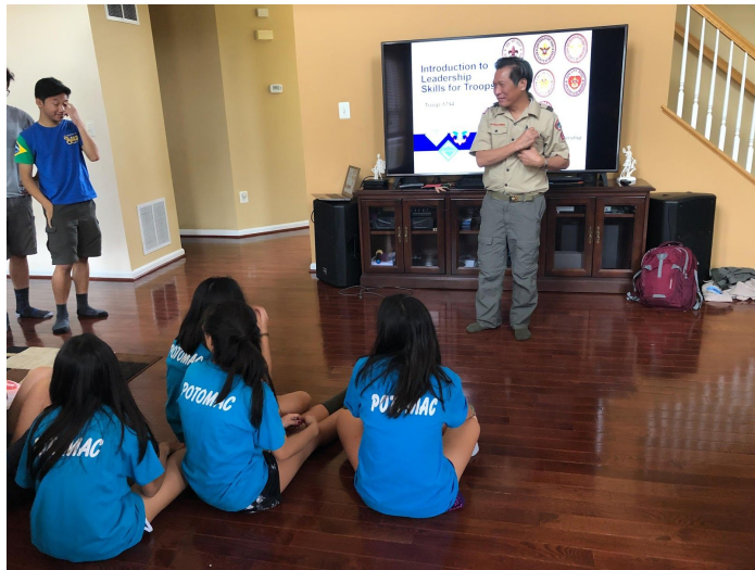
Tr Son opening the ILST class