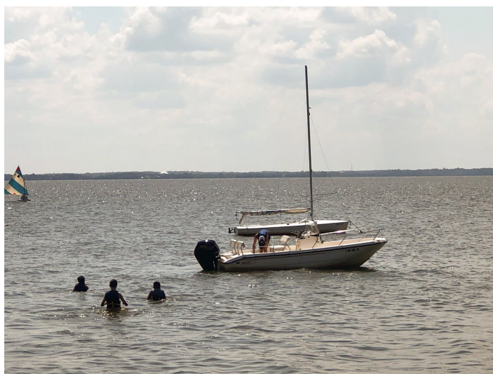
Scouts swimming to the boat