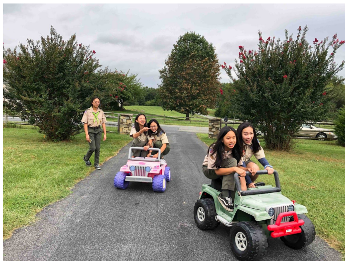
Scouts reliving their elementary school days