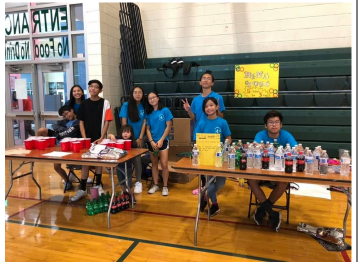
Scouts taking care of the game tables