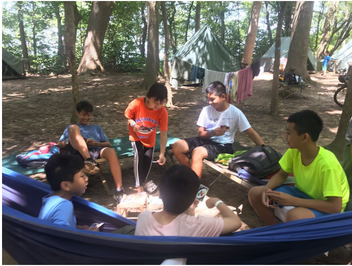
Scouts having fun over UNO