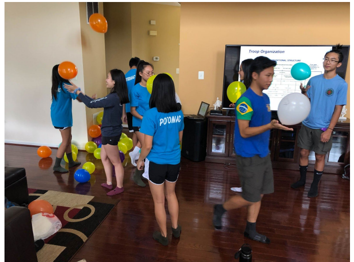
Scouts learning about balloon delegation