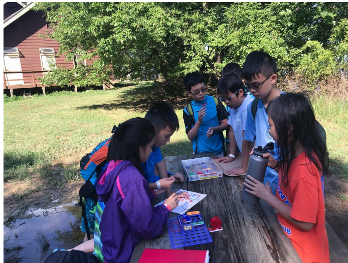
Scouts experimenting in the Engineering MB class