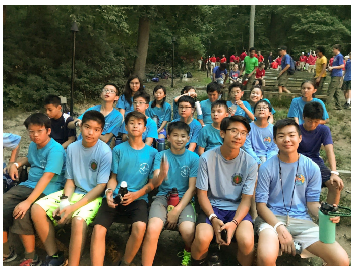
Troop waiting for the opening campfire program