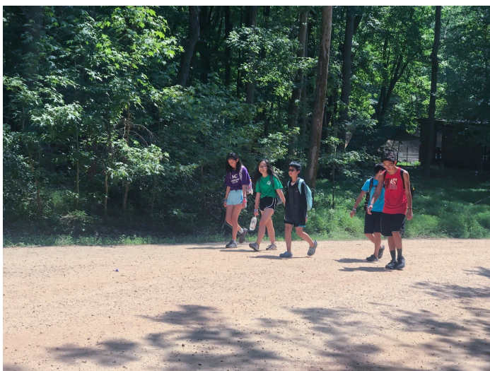
Scouts heading to merit badge class