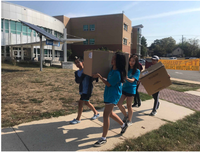
Scouts carrying the cotton candy machine