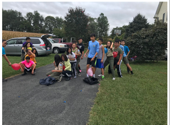
Playing an ice breaker game