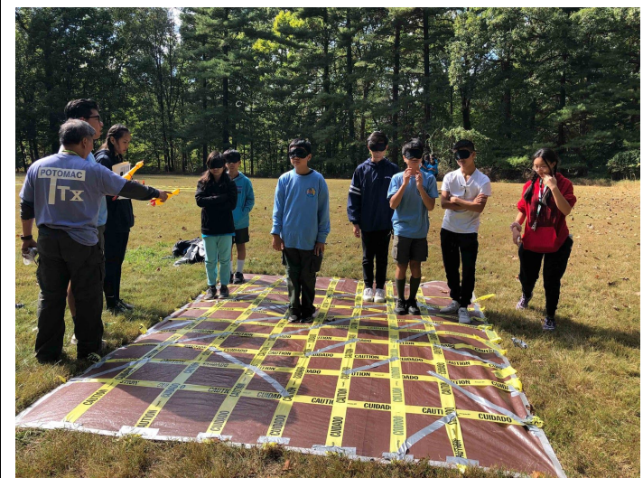
Scouts playing the maze game