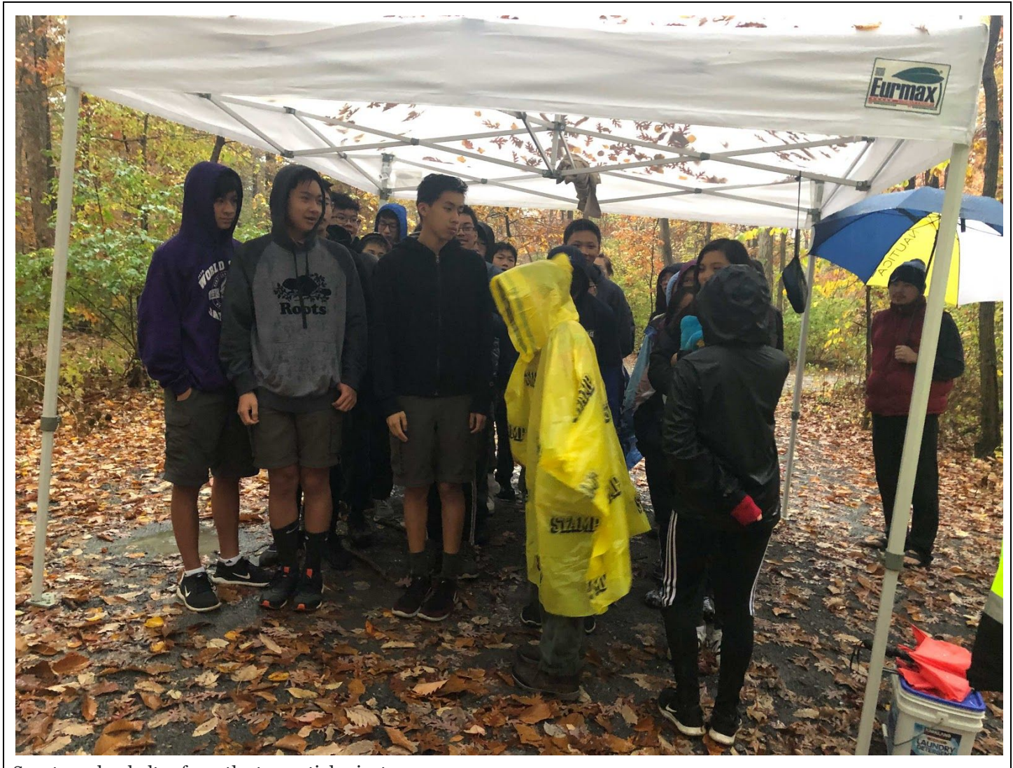
Scouts seeks shelter from the torrential rainstorm