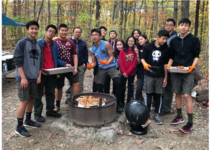
Scouts grilling chicken

Around 4am, a major rain storm arrived. A lot of our tents took water and our bedding were wet. We were packing up camp during a torrential downpour. Luckily, it wasn't that cold. We did our closing under a canopy. We packed our tents and clean up our campsite in record time and left camp shortly after closing.