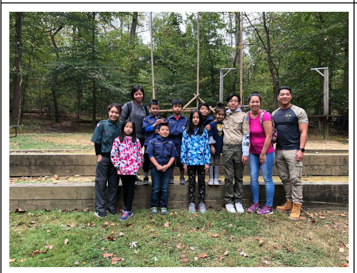
Our first time campers