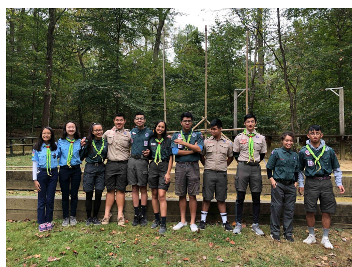
Our "Kunfu Panda" camp staff