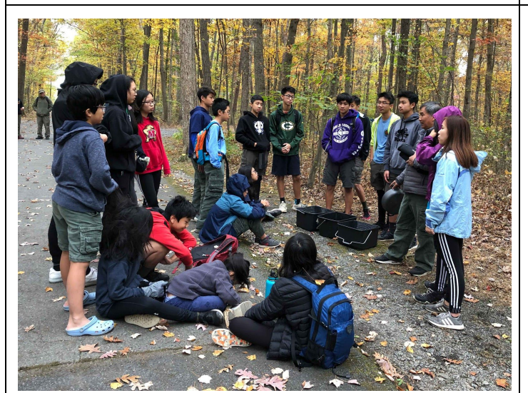
Scouts learning about the 3-bucket system