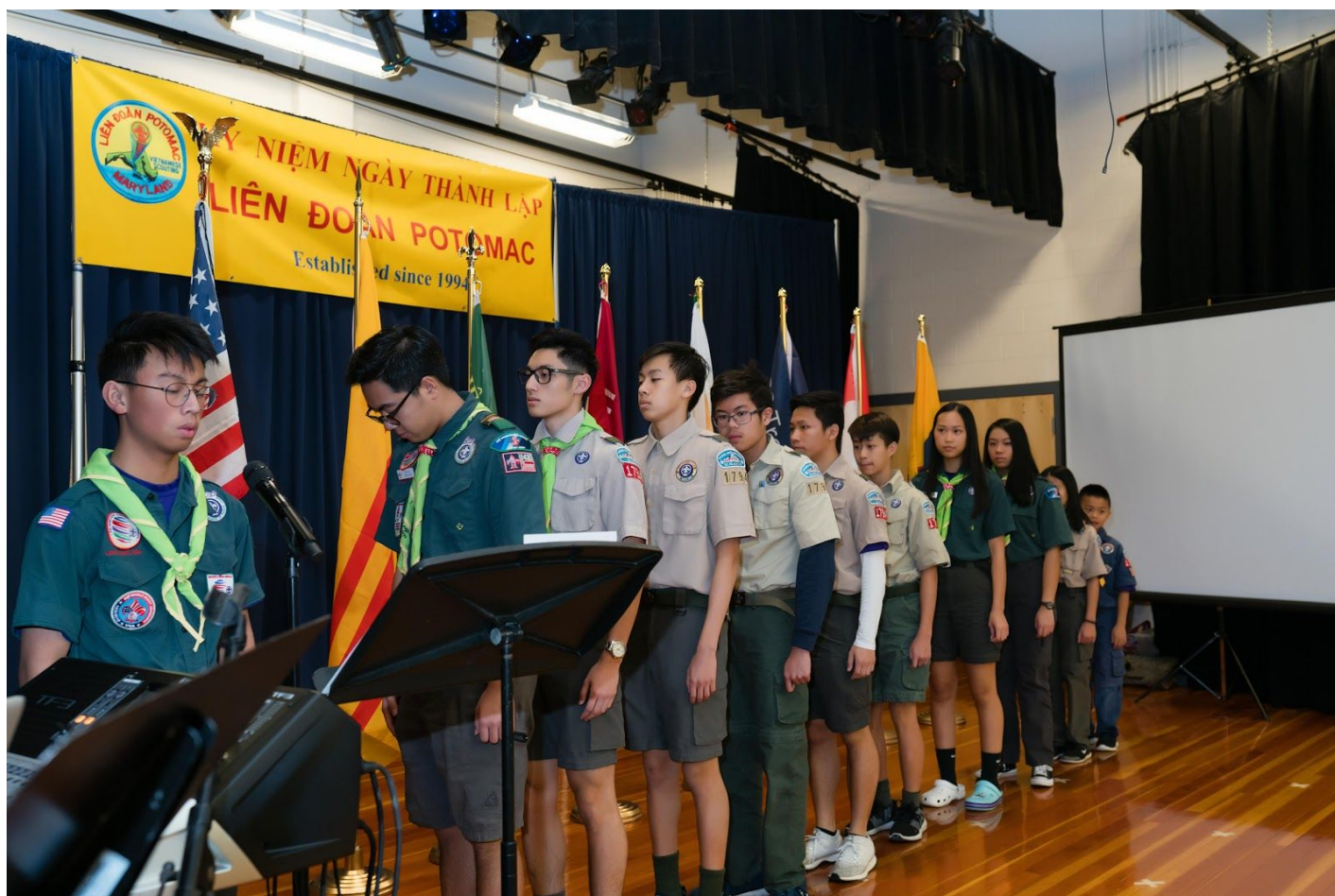
Our scouting units opening the ceremony