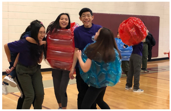
Scouts having fun in the gym