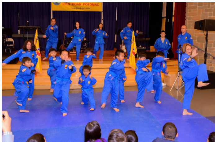
Vovinam showing moves