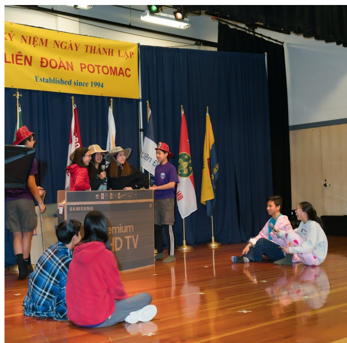
Girl Troop performance Dầu Xanh