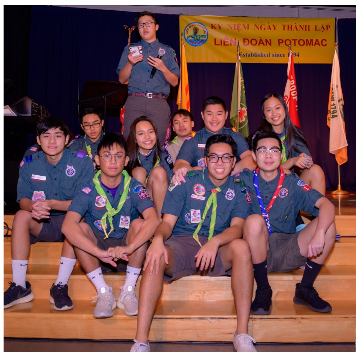
The Venturing Crew reflects on the last 5 years