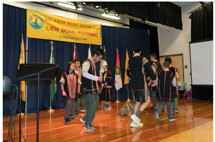
Scouts performing Một Mẹ Trăm Con