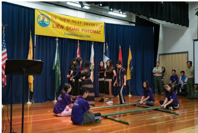
Scouts doing the traditional bamboo dance